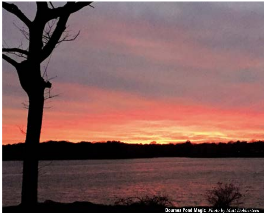
Bournes Pond Magic