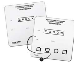
Near Card in logMAR or single critical line format with 16-inch cord (@ 20/50, 20/40, and 20/32)