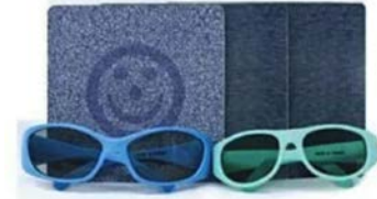
PASS 1-OH Stereo Smile @ 16 inches

Since the publication, two notable updates have emerged. First, there is now a Near Visual Acuity single line card available for preschoolers at 20/50 and 20/40. Second, it has been clarified that the approved stereoacuity test is the Pass 1-OH (with 120 seconds of arc).